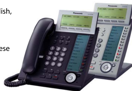
KX-NT300 series IP Proprietary Telephones

The IP telephones offer superb voice quality thanks to handsfree speakerphone and acoustic echo cancellation. The sleek, ultra-modern design, available in both black and white works well with any work environment and office decor.