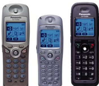
KX-TCA series DECT wireless handsets

The KX-TDE PBX supports wireless mobility solution via an integrated Multi-Cell DECT System. This system provides automatic hand-over between installed wireless cells - enhancing coverage and giving you true communication mobility even across large premises.